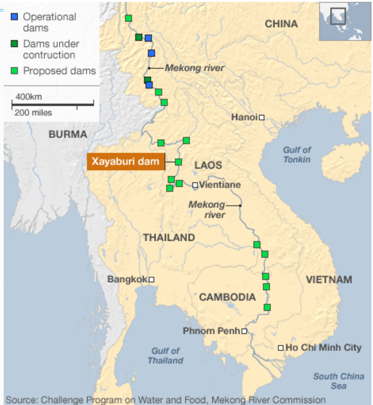
Mainstream dams on the Mekong